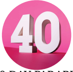
40 DAY PARABLE